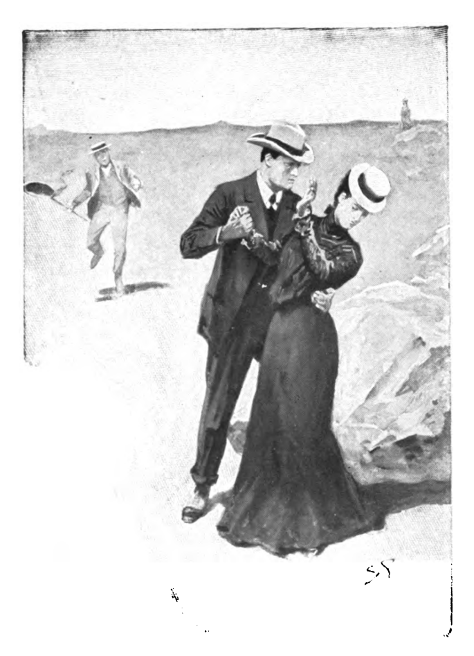
Sir Henry suddenly drew Miss Stapleton to his side.