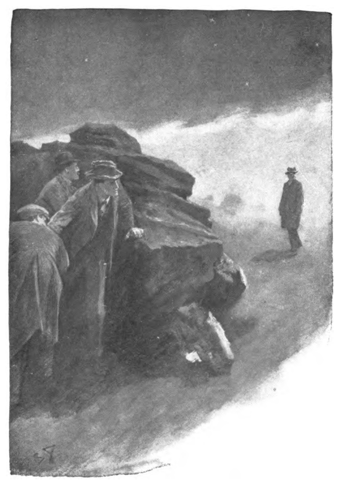
The steps grew louder, and through the fog, as through a curtain, there stepped the man whom we were awaiting.