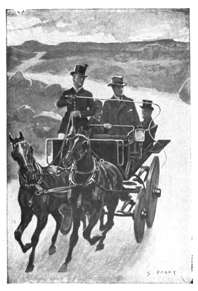
The driver pointed with his whip. "Baskerville Hall," said he.