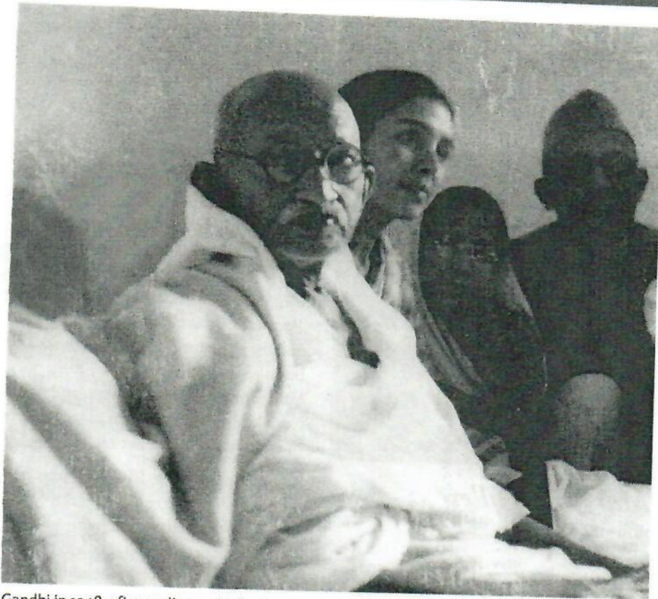
Gandhi in 1948, after ending a six-day hunger strike for peace

scaffold 4 and we will do so laughing. Shower what sufferings you like upon us, we will calmly endure all and not hurt a hair of your body. We will gladly die and will not so much as touch you. But so long as there is yet life in these our bones, we will never 30 comply with your arbitrary laws. ☞