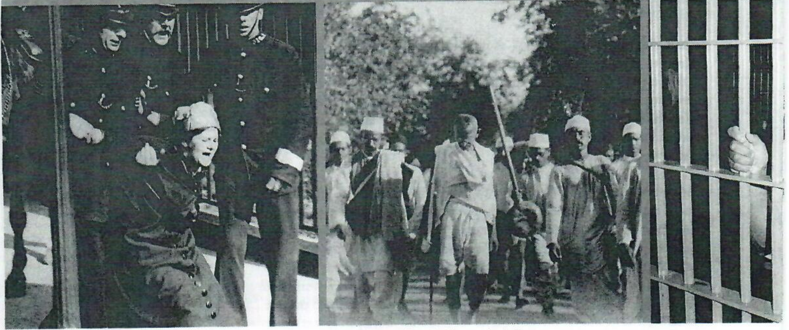
Left: London police arresting a suffragist, 1914; center: Gandhi marching to the sea, in defiance of the British salt monopoly

whom I could name,—if ten honest men only,—ay, if one honest man, in this State of Massachusetts, ceasing to hold slaves , were actually to withdraw from this copartnership, and be locked up in the county jail therefor, it would be the abolition of slavery in America. For it matters not how small 110 the beginning may seem to be: what is once well done is done forever. But we love better to talk about it: that we say is our mission. Reform keeps many scores of newspapers in its service, but not one man. . . .