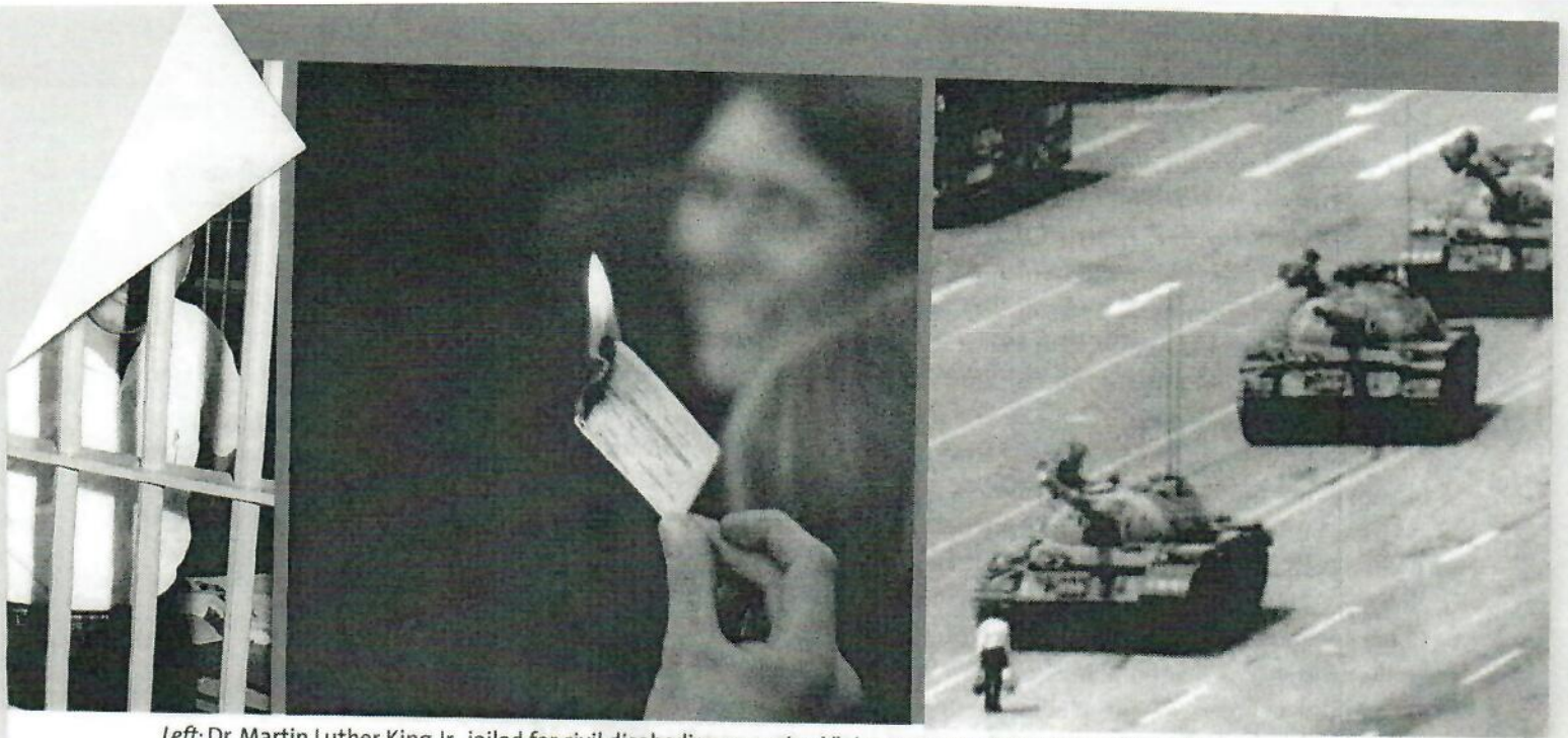
Left: Dr. Martin Luther King Jr., jailed for civil disobedience; center: Vietnam war protester burns his military draft card; right: Beijing man stands in front of tanks during the 1989 Tiananmen Square uprising.

this year, that would not be a violent and bloody measure, as it would be to pay them, and enable the State to commit violence and shed innocent blood. This is, in fact, the definition of a peaceable revolution, if any such is possible. If the tax-gatherer, or any other public officer, asks me, as one has done, "But what shall I do?" my answer is, "If you really wish to do anything, resign your office." When the subject has refused allegiance, and the officer has resigned his office, then the revolution is accomplished. But 140 even suppose blood should flow. Is there not a sort of blood shed when the conscience is wounded? Through this wound a man's real manhood and immortality flow out, and he bleeds to an everlasting death. I see this blood flowing now. . . . E