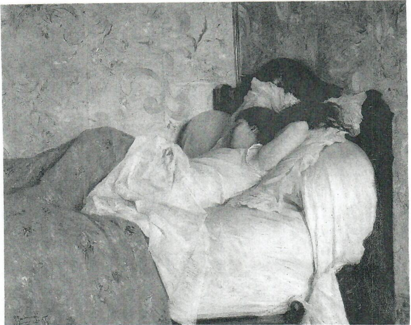
In Bed (1878), Federico Zandomenighi. Oil on canvas, 60.5 cm × 73.5 cm. Galleria d'Arte Moderna, Florence.

But now I am used to it. The only thing I can think of that it is like is the color of the paper! A yellow smell. Ⓚ