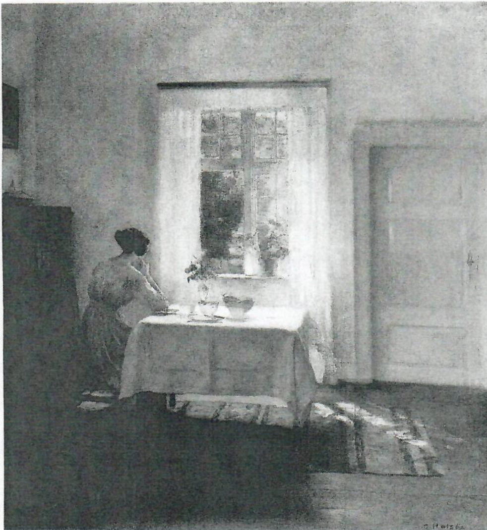
A Woman Seated at a Table by a Window , Carl Holsoe. Oil on canvas.

Then he took me in his arms and called me a blessed little goose, and said he