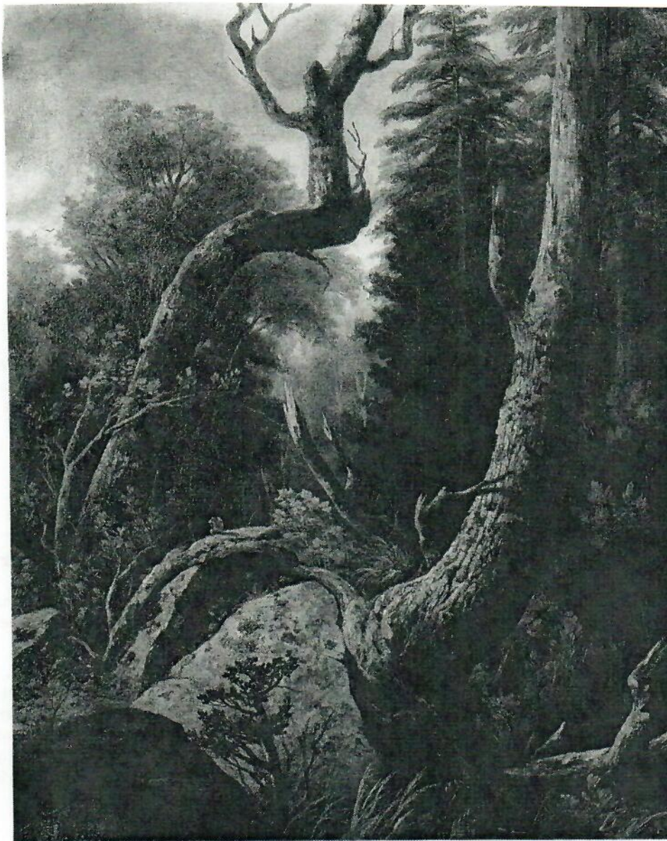
Forest Landscape (1800s), Asher Brown Durand. Oil on canvas, 76.2 cm × 66 cm.

to stick at trifles when money was in view. When they had reached the edge of the swamp, the stranger paused. “What proof have I that all you have been telling me is true?” said Tom. “There’s my signature,” said the black man, pressing his finger on Tom’s forehead. So saying, he turned off among the thickets of the swamp, and 140 seemed, as Tom said, to go down, down, down, into the earth, until nothing but his head and shoulders could be seen, and so on, until he totally disappeared.