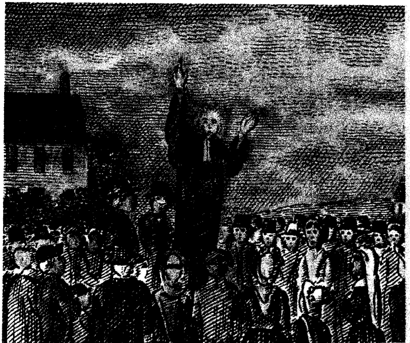
Evangelical preacher George Whitefield was a key figure in the revival movement of America's "Great Awakening."