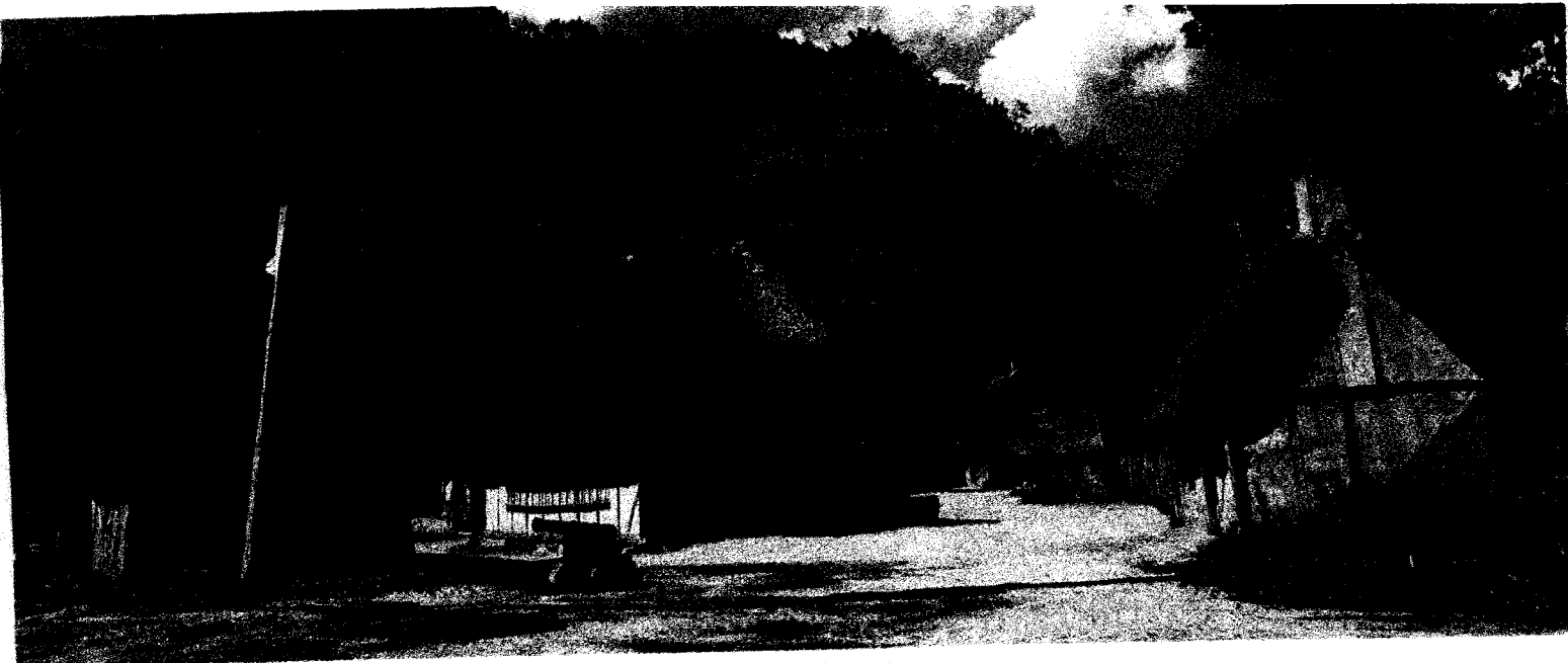
A modern reconstruction of the original Jamestown, Virginia, settlement

COLONIAL HISTORIES As the colonies took root, writing began to focus less on pure description and more on the story of the growth of the colonies. In contrast to the carefully accurate Harriot, for example, Captain John Smith wrote sometimes-embroidered accounts of the history of Virginia and New England. By force of his vivid and engaging writing, he created an enduring record of life in the early colonies and an intriguing self-portrait of a man proud of his great deeds and eager to gain recognition. His accounts were also instrumental in attracting settlers to Virginia, thus ensuring the eventual success of that colony.